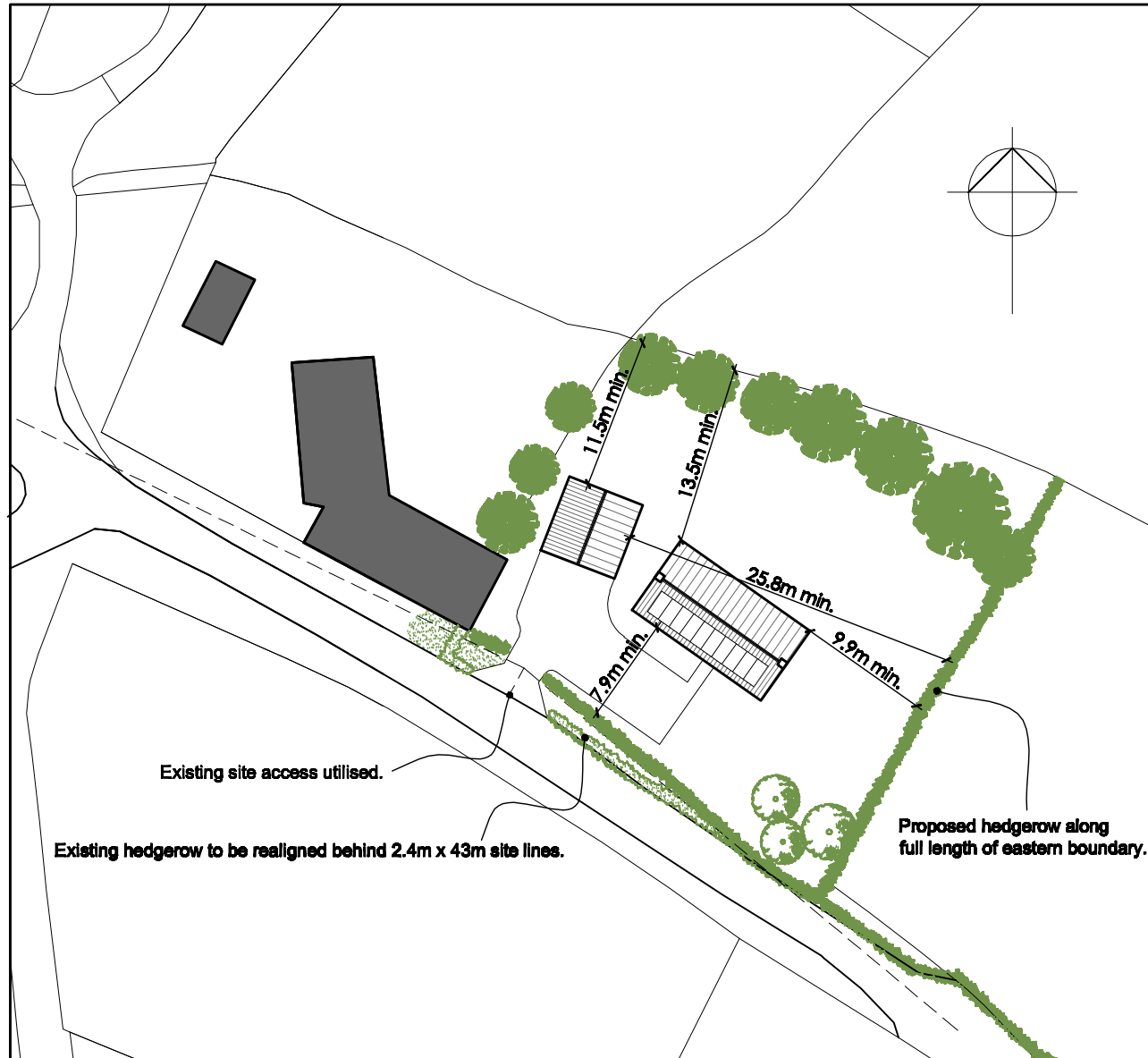
BLOCK & ROOF PLAN 1:500